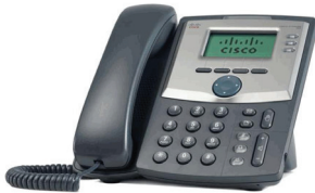
Cisco SPA 303 1 Line Entry Level $176 inc-GST