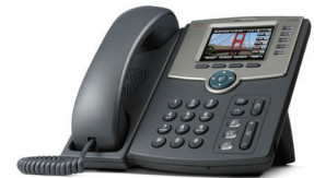
Cisco SPA 525G 5 lines Premium $440 inc-GST