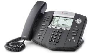
Polycom IP650 6 line Premium $525 inc-GST