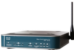
Cisco SRP527W ADSL2+ Modem, Router, 4 Port Switch, Wireless N, 3G Backup, Quality of Service. Automatic Configuration of Cisco Handsets $286 inc-GST